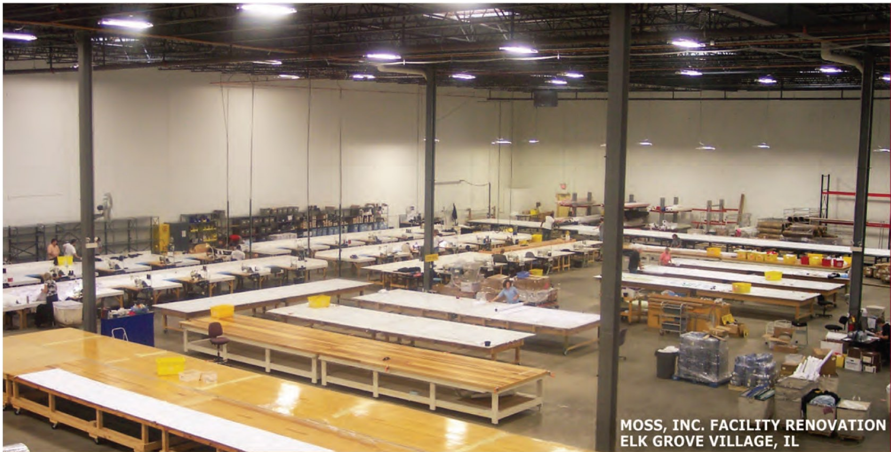
MOSS, INC. FACILITY RENOVATION ELK GROVE VILLAGE, IL