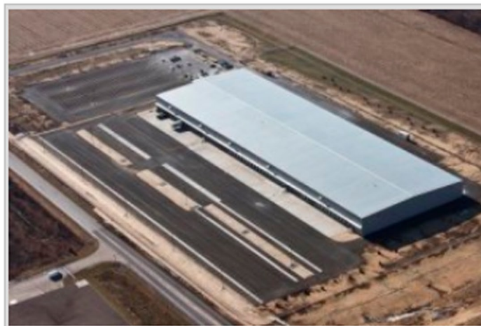
Rock Island Distribution Center

Meridian Design Build recently completed work on a 189,926 SF build to suit in the Quad Cities area for Indianapolis based developer Scannell Properties. The new automated package sortation and distribution facility is located on a 29 acre site in Rock Island, IL at Route 92 and Turkey Hollow Road.